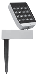
AC037 EARTH SPIKE